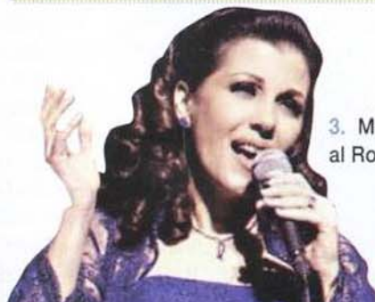
3. Magida al Roumi