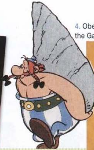
4. Obelix the Gaul